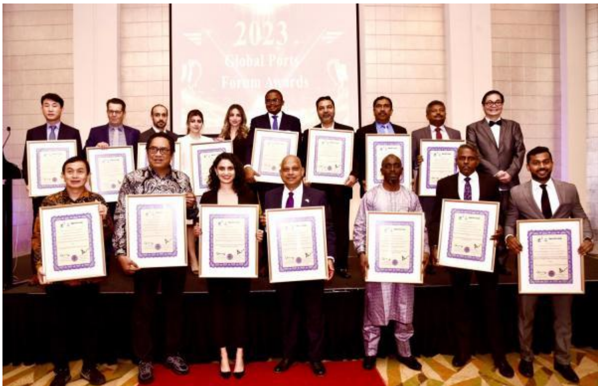
Direksi TPS bersama para penerima Penghargaan GPF 2023.