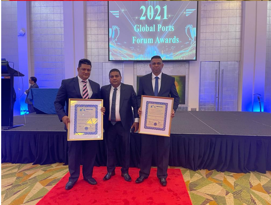
Sabah Ports bag two global port awards Published on: Thursday, December 30, 2021, Sabah Express