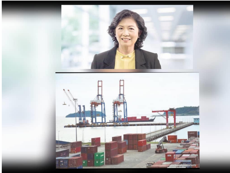
The Sapangar Bay Container Port.

KOTA KINABALU: Sabah Ports Sdn Bhd (SPSB) received two global awards for ‘Emerging Port/Terminal of the year 2021’ and ‘Port/Terminal of the Year – South East Asia 2021’ by the prestigious Global Port Forum. This marks SPSB’s second consecutive win after being awarded the Port/Terminal of the Year – South East Asia in 2020.