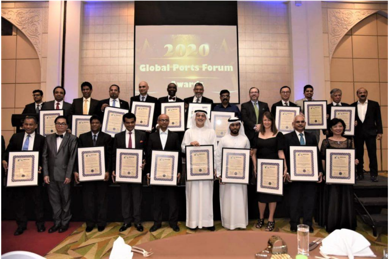
Award winners of the Global Ports Forum Awards 2020