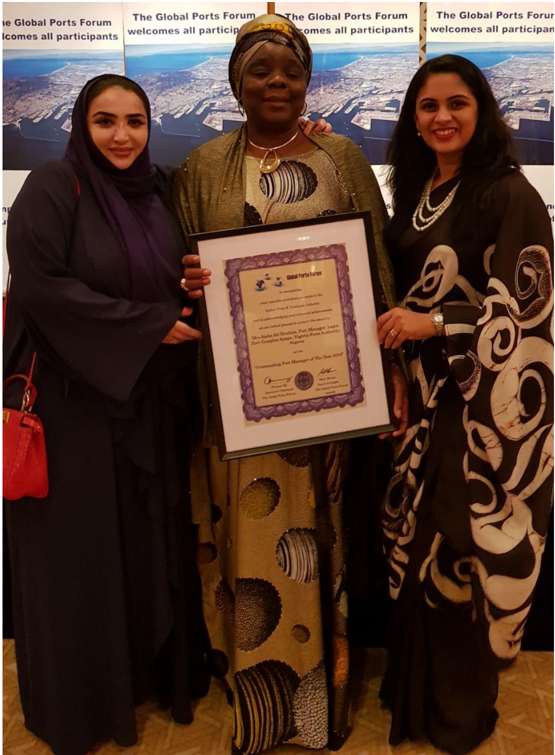
Copyright 2018 Ships & Ports Ltd. Permission to use quotations from this article is granted subject to appropriate credit given to www.shipsandports.com.ng as the source.