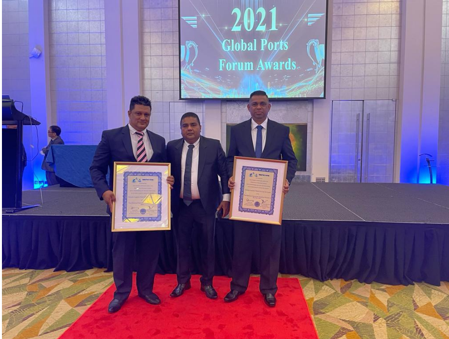
Sabah Ports bag two global port awards Published on: Thursday, December 30, 2021, Sabah Express